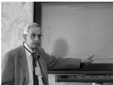
John Nash gives plenary talk on GTM2008

In 2002 he participated in the INTERNATIONAL CONGRESS OF MATHEMATICIANS Game Theory and Applications Satellite Conference in Qingdao (China) as Invited Speaker. This Conference was supported by St. Petersburg State University (Russia) and The International Society of Dynamic Games (Russian Chapter). In 2008 he participated in the Second International Conference GAME THEORY AND MANAGEMENT in St. Petersburg (Russia) as plenary speaker. This Conference was organized by St. Petersburg State University and International Society of Dynamic Games (Russian Chapter). Below are the photos from these two conferences: